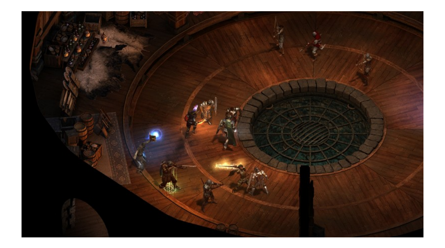
Pillars Of Eternity - The White March Part II Free Download [portable]

Download >>> <a href="http://bit.ly/2NGIKD1">http://bit.ly/2NGIKD1</a>